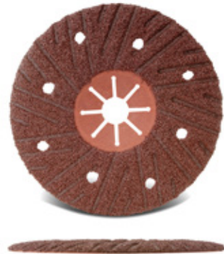
A Aluminum Oxide