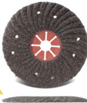
C Silicon Carbide